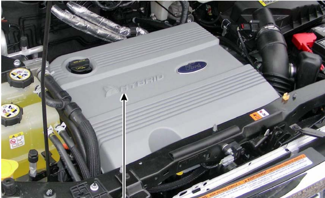
Unique Hybrid Engine Appearance Cover with Green Leaf Highway Icon