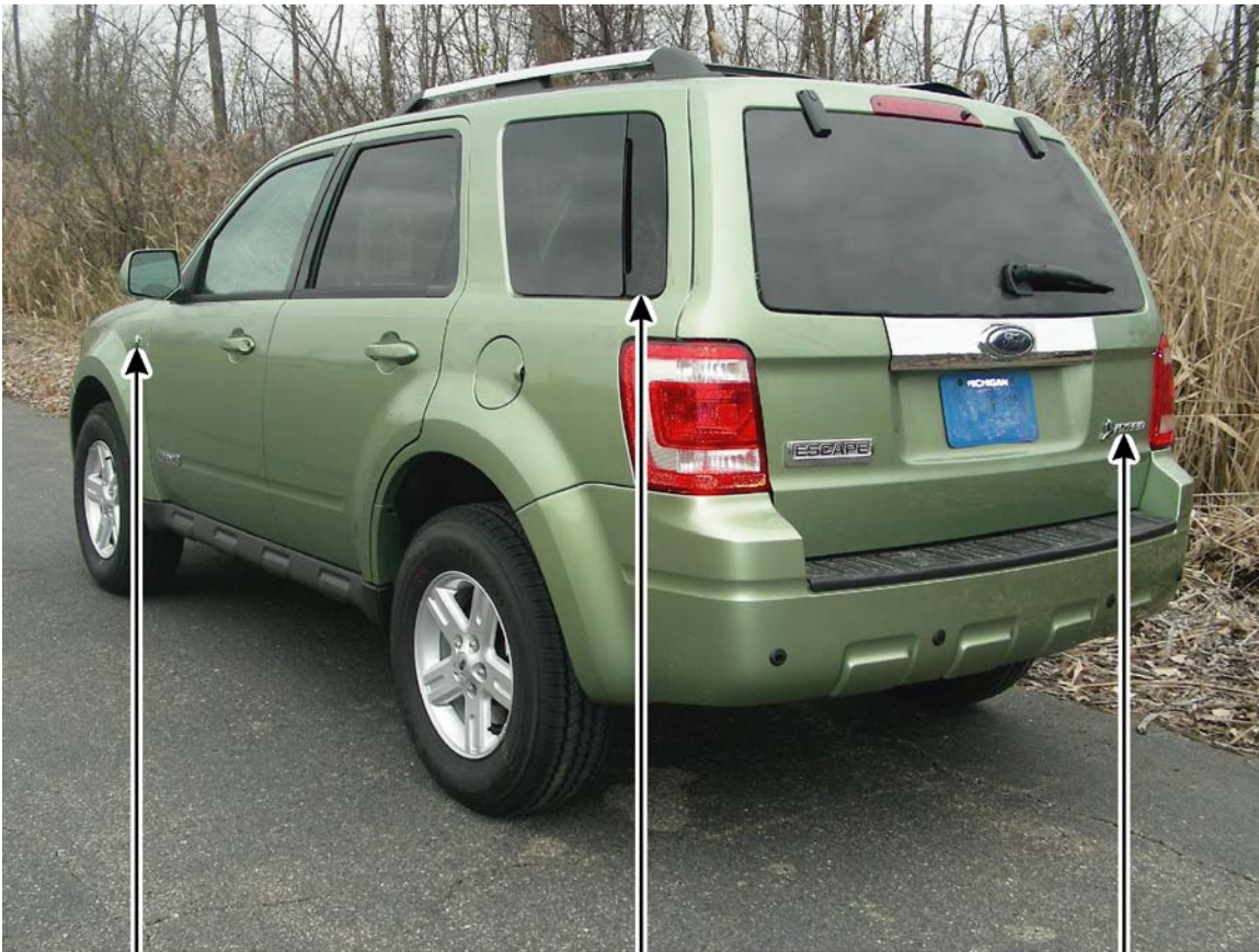
Green Leaf Highway Badge on Fender