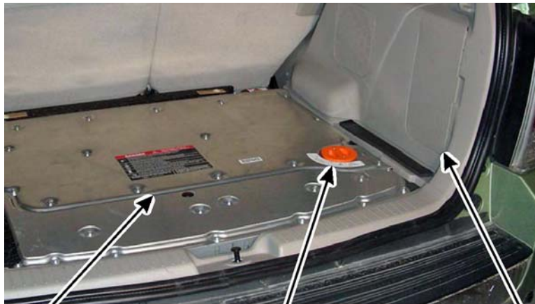
High-Voltage Battery Pack

Note: The high-voltage service disconnect switch should be moved to the service/shipping position if possible.